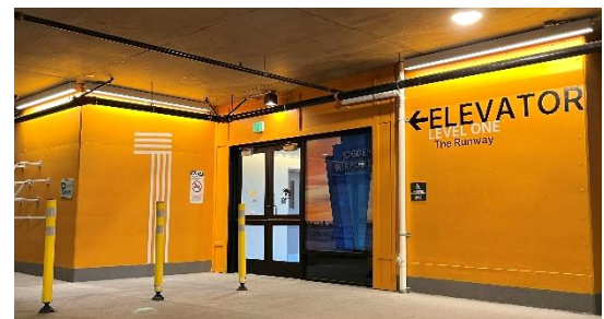
Level one elevator entrance in WonderBlock garage