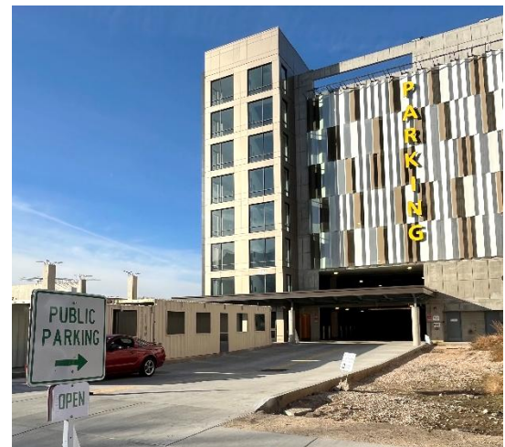
WonderBlock garage is now open to public – Jan. 11 photo