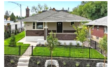
Renovated and sold home at 1183 28th St.