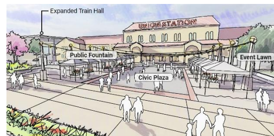
Union Station Campus concept rendering