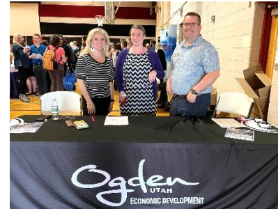
Ogden team w/WSU leader at Federal Employee Event