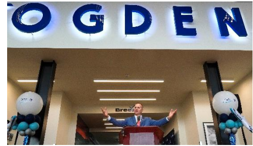
Mayor Ben Nadolski firing up the crowd gathered for the new Ogden Airport terminal grand opening – Nov. 14