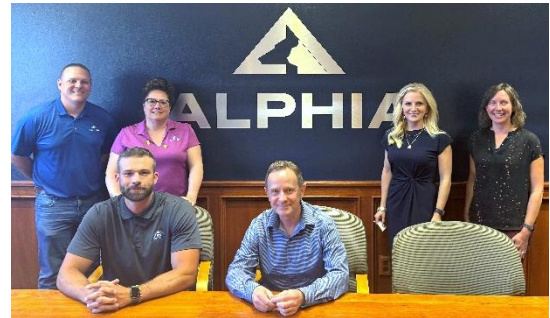
Alphia management w/City Economic Development team – June 25, 2025