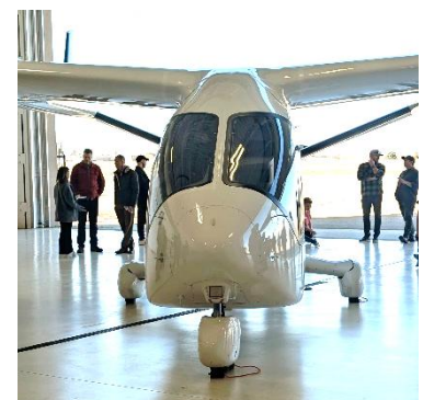
BETA Technologies advanced electric aircraft at Ogden Airport – Mar. 2025