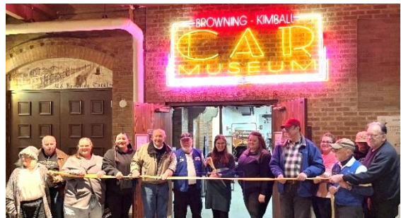
Volunteers and staff at ribbon-cutting and reception for the updated Union Station Car Museum – Jan. 2025