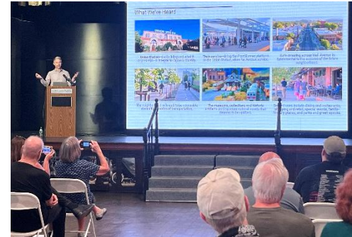
"You Make Ogden" Union Station Update – Sept. 24