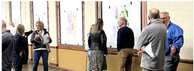
Citizens engaging with city staff at Zone Ogden open house – Oct. 22