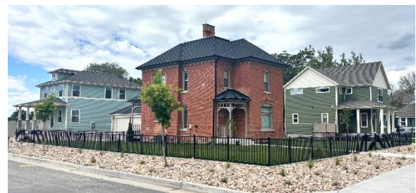
Renovated historic home at 2329 Quincy Street