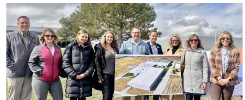
Ogden City team at Williams International groundbreaking event – Apr. 2025