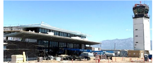
Ogden Airport expansion construction – June 20, 2025