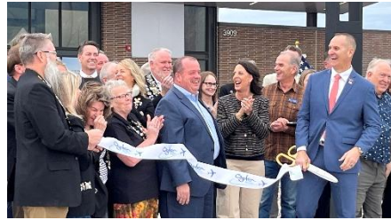
Area officials and Chamber Spikers at ribbon cutting for new Ogden Airport terminal expansion – Nov. 14