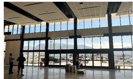
Interior east view out the front doors of the new Ogden Airport terminal addition – Sept. 15