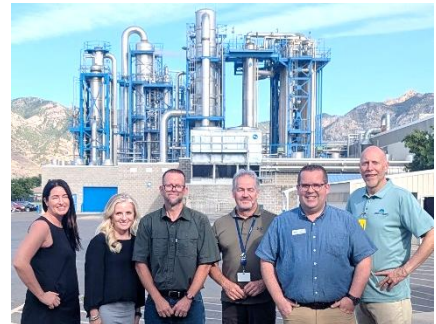
Ogden City Economic Development/Marketing staff and Chamber president with Fresenius leaders – Sept. 11