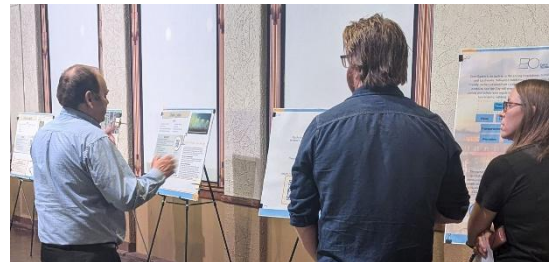
Zone Ogden public open house event – May 28