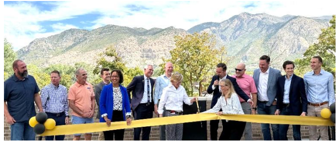
Ribbon-cutting event for Q25 – Sept. 10