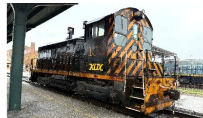
New arrival at Union Station – DRGW #133