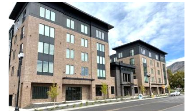
New Q25 Development