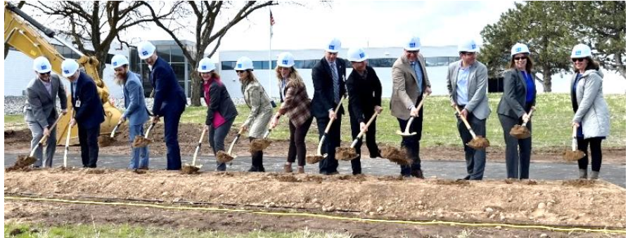
Williams International groundbreaking with company and city staff – Apr. 2025