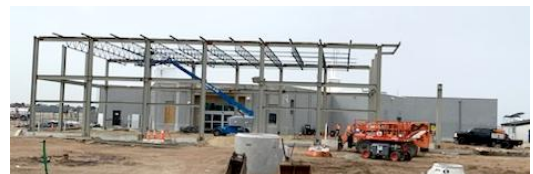
Structural steel being installed to support terminal expansion – Mar. '25