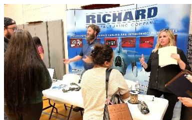
Hiring Employer at Federal Employee Resource Event