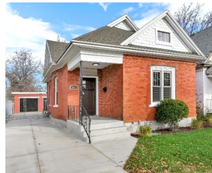
Renovated home – 470 30 th Street