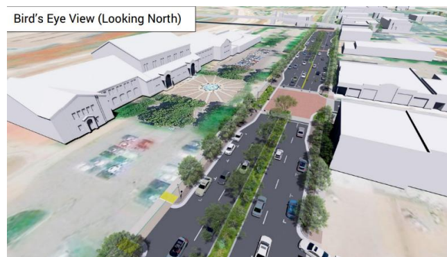
Wall Avenue Study Concept Rendering