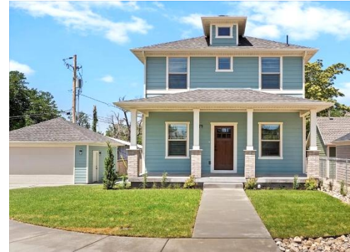
New home completed and sold in Sycamore Cove – 874 Cahoon