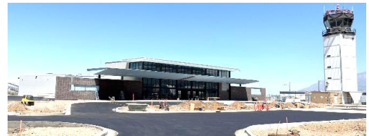
Ogden Airport exterior, showing new facade and paving – Aug. 1, 2025