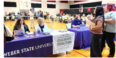
WSU team at Federal Employee Resource Event