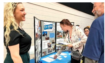
Ogden City HR at Federal Employee Resource Event