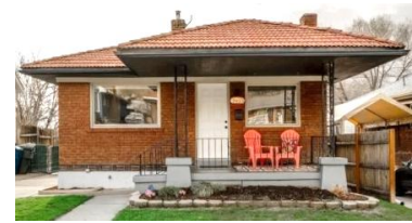
Renovated and sold 2823 Eccles Avenue