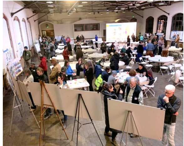
Plan Ogden Vision Celebration public engagement at Union Station – Jan. '25