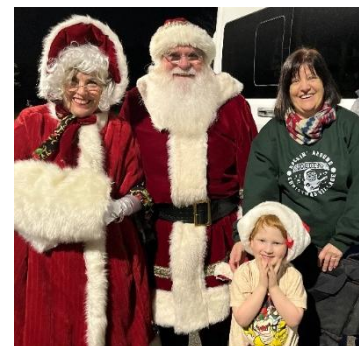
Mrs. Claus/Santa (and fans) after Electric Light Parade – Nov. 29