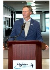
Congressman Moore at terminal opening