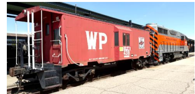
Western Pacific Caboose #438 – now at Union Station