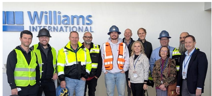
Williams International team with Ogden City team – Dec. 12