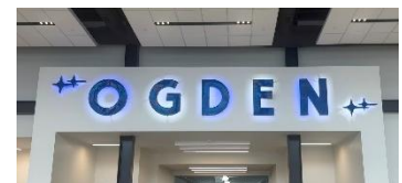
Restored sign inside new airport terminal