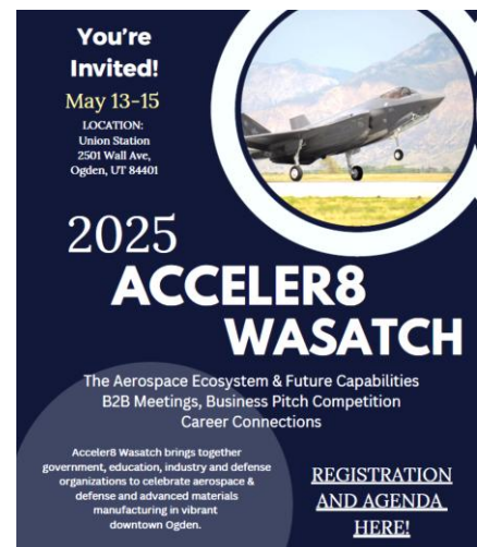
Promotional flyer for Ogden's Acceler8 Wasatch aerospace and defense event