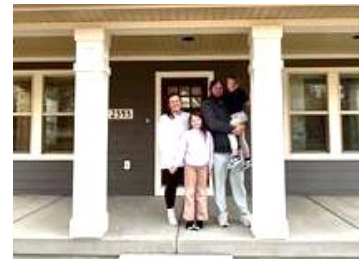
New Sycamore Cove homeowners – 2343 Quincy