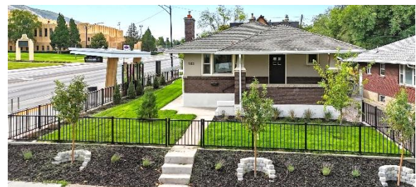
Renovated home at 1183 28th Street