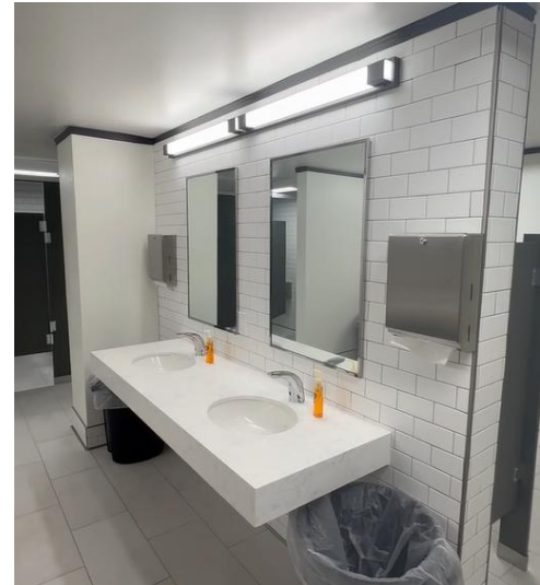
Newly remodeled restrooms at Ogden Airport