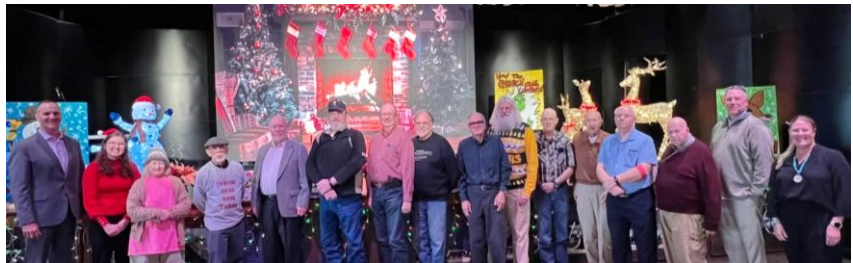
Museums Volunteer Luncheon – Dec. 16