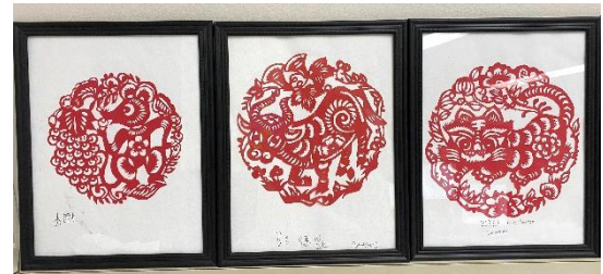
One of the displays at the Chinese New Year Paper-Cutting Exhibition in the Gallery at Union Station