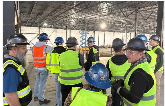
Williams International facility expansion tour – Dec. 12