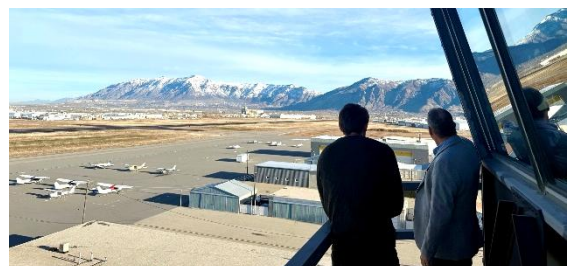
Ogden Airport tower tour for social media influencers – Dec. 12