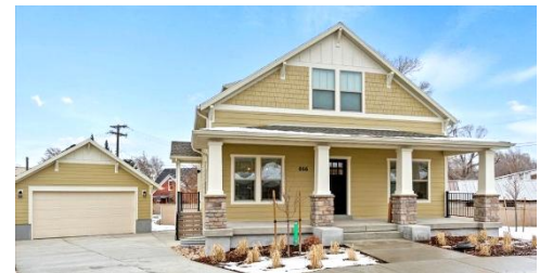
New home at 866 Cahoon Circle now listed for sale