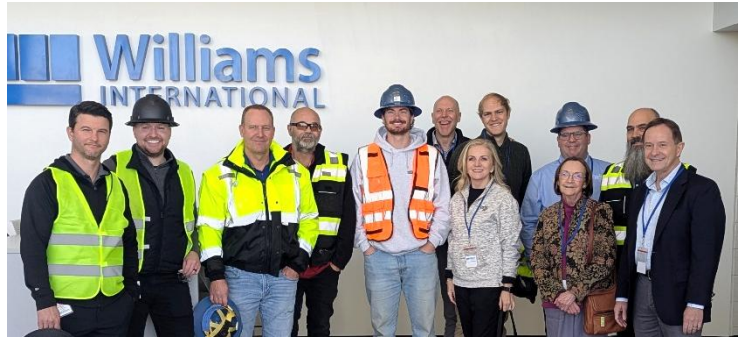
Williams International team with Ogden City team – Dec. 12