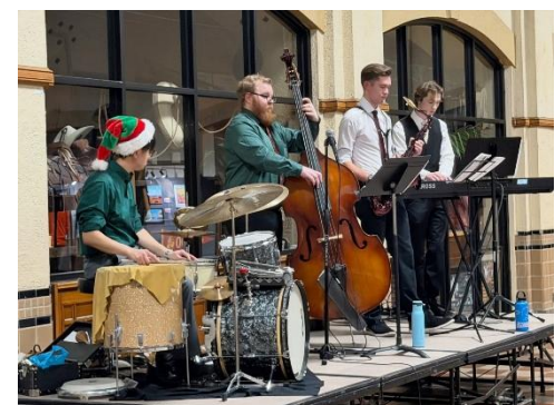
Jazz at the Station – Dec. 10