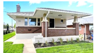
1183 18th St. – renovated and listed for sale