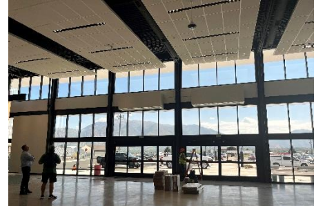
Interior east view out the front doors of the new Ogden Airport terminal addition – Sept. 15