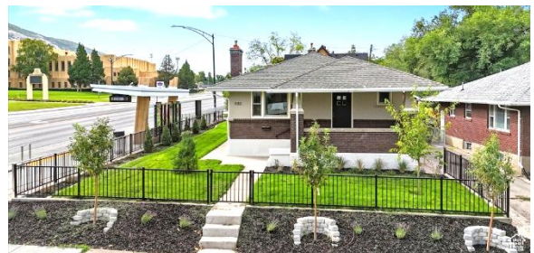
Remodeled and newly listed home at 1183 28th Street