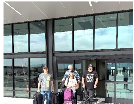
First arriving passengers to leave through the front doors of the new Ogden Airport Terminal addition – Sept. 19