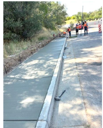
Sidewalk improvements underway on Jackson Ave.