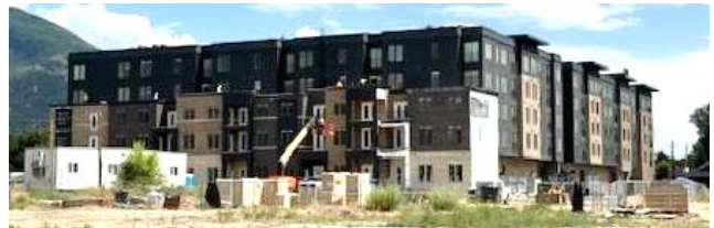
Q25 multi-family housing project – Quincy and 25th