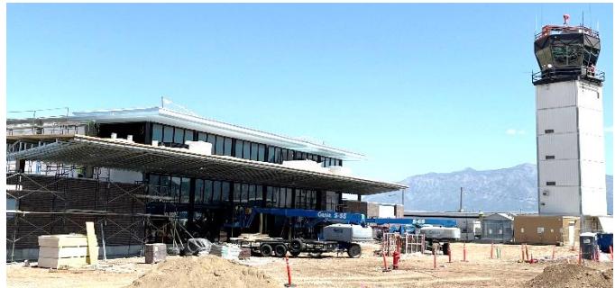
Ogden City Airport expansion construction – June 20, 2025