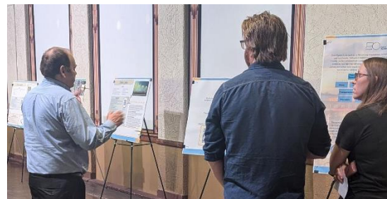
Zone Ogden public open house event (May 28)