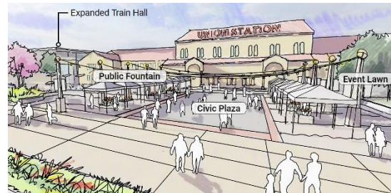
Union Station Campus concept rendering