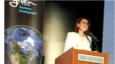
Lt. Governor Deidre Henderson speaking at Acceler8 Wasatch event at Union Station.