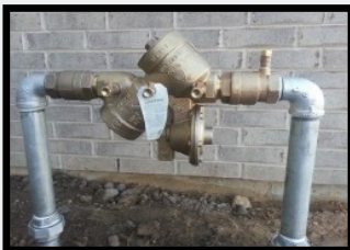
Reduced Pressure Principle Assembly (RP)

Cross-connections jeopardize culinary water supplies unless appropriate valves are installed on them. These special valves are called backflow prevention assemblies. These assemblies must be regularly tested and maintained.