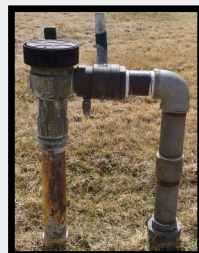
Pressure Vacuum Breaker (PVB)

Ogden City has surveyed many industrial, commercial, and institutional facilities in its service area for cross-connections. The City reduces the likelihood of cross-contamination by requiring water customers to install backflow assemblies on these cross-connections. Ogden City requires all water customers to have their backflow assemblies tested annually by a certified backflow tester. This assures the assembly is providing maximum protection.