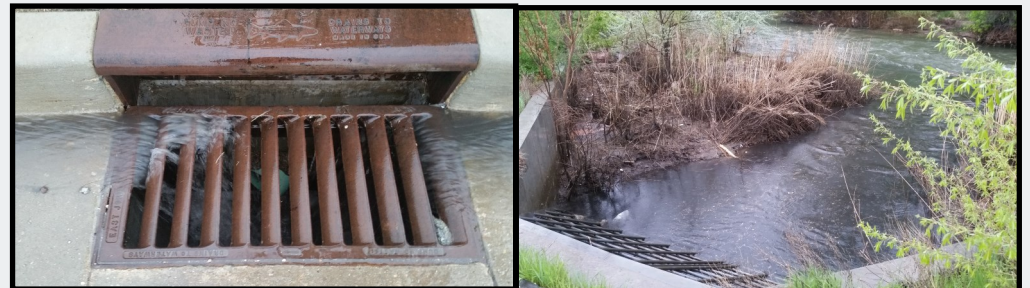
Storm water flows through storm drains directly to local creeks and rivers with NO TREATMENT.

There is a household hazardous waste facility located at the Weber County Solid Waste Facility at 867 West Wilson Lane . Oil, antifreeze, and paint are accepted. Weber County homeowners can bring their household hazardous waste to the facility and it will be taken off their hands for FREE! Call 1-801-399-8803 for more information.