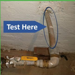
Sample Test Region

Feel free to email our inspectors at Sunrise Engineering. Please include your home address and question with a photo of your water pipe test region to: